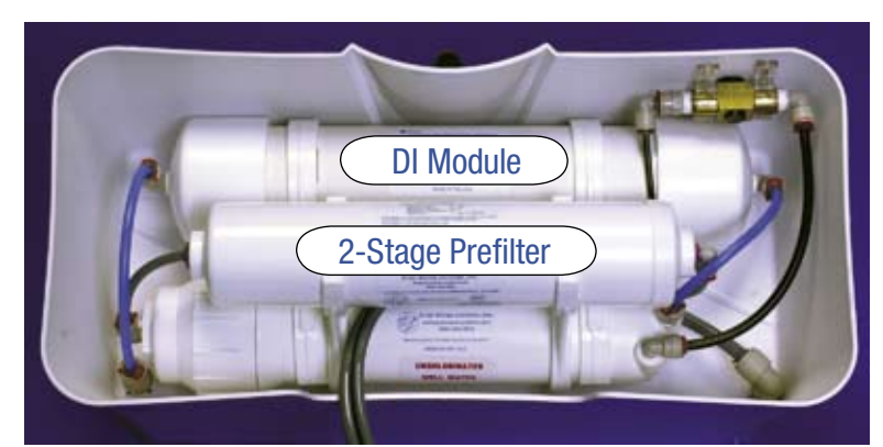
Figure 1, Underside of PWS-BEV-100 Series system

To insure your system will be water-tight even after being shipped across country, we have inserted small [red] plastic retaining clips on each fitting. These are easily removed with your fingers or, if